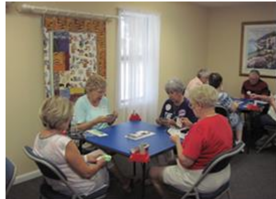
Mt. Home Players support Charity.

We had 12 door prizes for each pair of short games. All this was donated or brought in by our members. We had a great time and I have already booked a place for next year.”